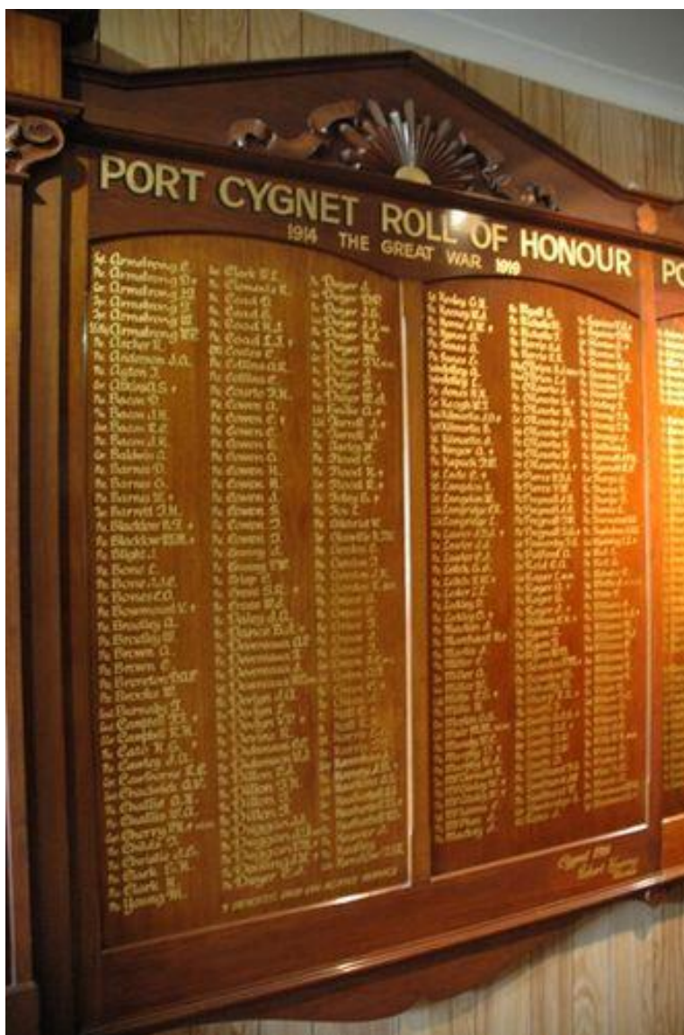
Port Cygnet Roll of Honour Board